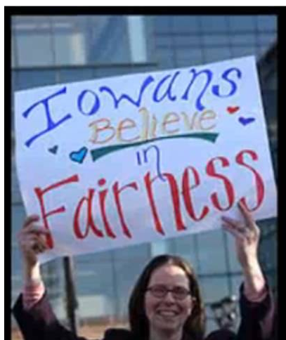
One Iowa “History in the Heartland” video image

There is a continuum in people’s minds between fairness and equality . Those who know gay and lesbian people well are supportive of equality for all. But remember, the folks who are not yet with us are struggling with these ideas. They want to treat all couples fairly —but they really may not yet be ready to embrace equality . When talking about marriage, emphasize fairness because most people are willing to give a fair shake to someone, even if they don’t feel they are truly equals. And building on the idea of fairness (the Golden Rule), again, connects in personal terms to why marriage matters.